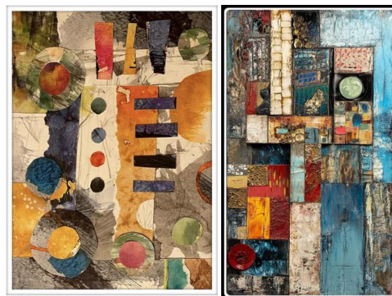
Image3. Artworks that demonstrate the use of diverse textures and techniques for abstract art designs.