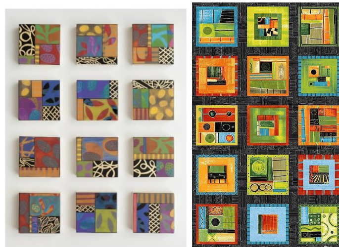
Image: 2 Examples of geometric abstract art