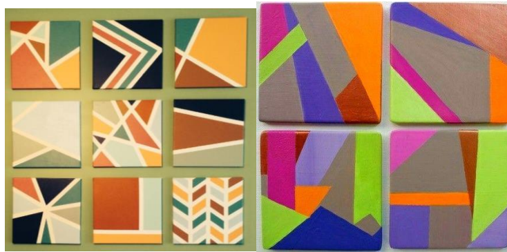
Image: 1 Examples of geometric abstract art

There are two types of abstract art: geometric abstraction, led by the artist Piet Mondrian, which was the basis for research into merging it with Asir art, and abstract expressionism, led by the artist Wassily Kandinsky.