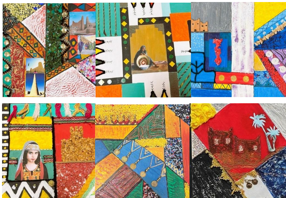
Image: 4 Detailed photos showing the details of the elements used, Asir art decorations and the materials used.