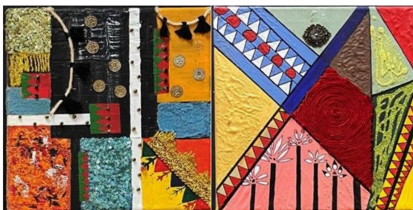
Image: 5 These paintings combine abstract art and Asir heritage and are executed in bright colours and different materials.